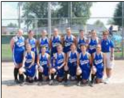
Lady Jays Softball placed 2nd place in the Wheatland Tournament.